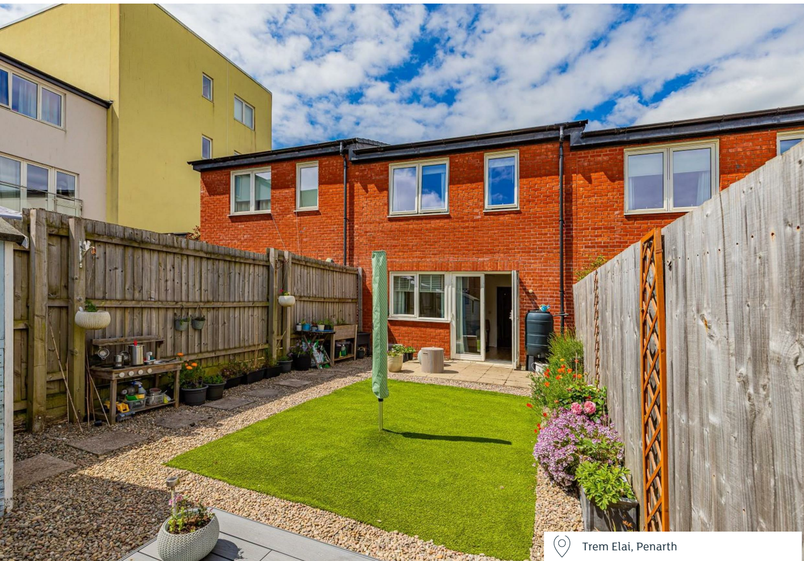
Trem Elai, Penarth